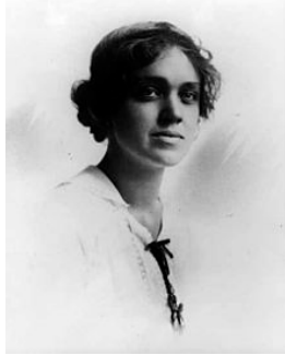
Agnes Smedley (1832-1950)

5. Manifesto of the Indian National Party. (1915): It denounced the British imperialism and declared state of war until the freedom is achieved.